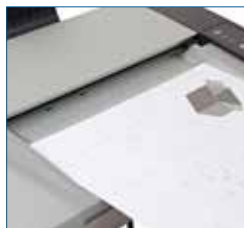
Support your documents with paper feed guides