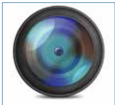
Contex CCD with ALE ensures precision of 0.1% accuracy

HD Ultra scanners are for customers who require a high throughput of documents, great flexibility and unmatched performance.