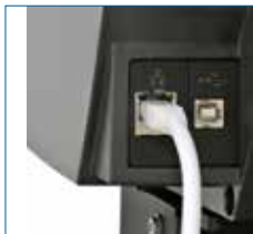
Fastest bandwidth in the industry w/ Gb Ethernet and xDTR2