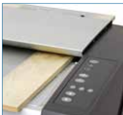
Scan thick originals with automatic thickness control (ATAC)