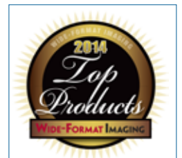
Contex HD Ultra awarded Best Wide Format Scanner for third consecutive year