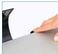
Easily adjust paper pressure to protect fragile documents