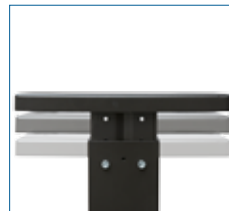
Height adjustable stand for optimal ergonomics